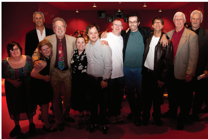
Russ "Riff" Tamblyn and George "Bernardo" Chakiris with Westside Special Actors Group performers at November 10 event