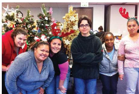
A scene from Options for Life's holiday tree auction during the Westside Regional Center's Holiday Craft Fair